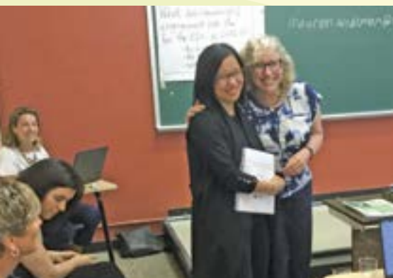
Successful Accreditation for ED Programs at the University of Manitoba and University of Victoria, June 2018.