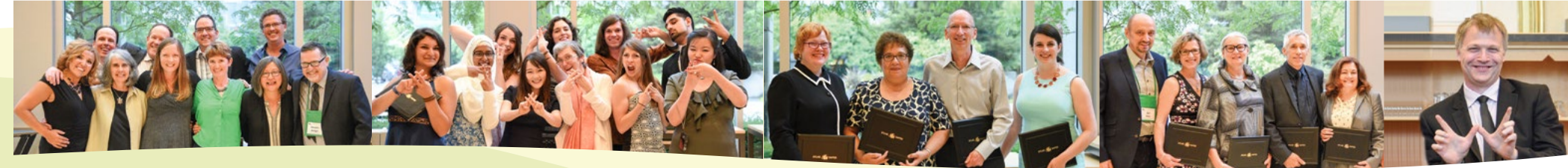
Knapper Lifetime Achievement Award

cohort of recipients of this award engaged in a one-day retreat in Kingston to share their expertise in learning and teaching. The cohort showcased their peer leadership examples and discussed how they would become involved in sharing and promoting quality teaching and learning, mentorship, and peer leadership with the broader EDC and STLHE community. In addition to supporting and ensuring the success of their students and teaching colleagues at their own colleges, these individuals provide exceptional leadership regionally, provincially, nationally and internationally in the field of teaching and learning.