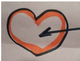
Get into the heart of the matter