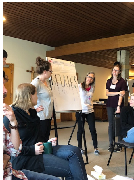
EDC Institute 2019, Guelph

The EDGEs program was developed to support the development of strong, meaningful professional networks among educational developers and teaching centres across Canada and beyond by funding exchanges to enable knowledge sharing, collaboration, and professional development. The recipients proposed innovative exchanges that aim to increase the impact of their work, to strengthen our collective community, and to produce concrete and sustainable outputs for applicants and their host