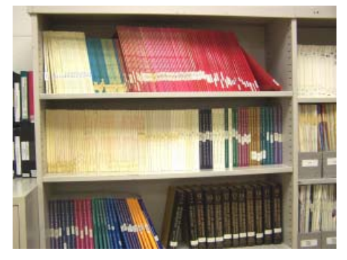
L'exemple des bibliothèques universitaires au Canada.

Prenons le cas de l'industrie du livre érudit et de la publication scientifique qui, en fait, constitue plutôt un marché, et pensons aux obstacles imposés aux chercheurs. Au moment où les coûts pour l'éducation