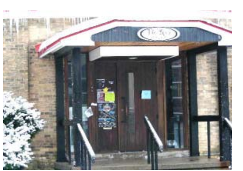
Guelph University and the University of Waterloo hosted the Educational Developers Conference, 2007.