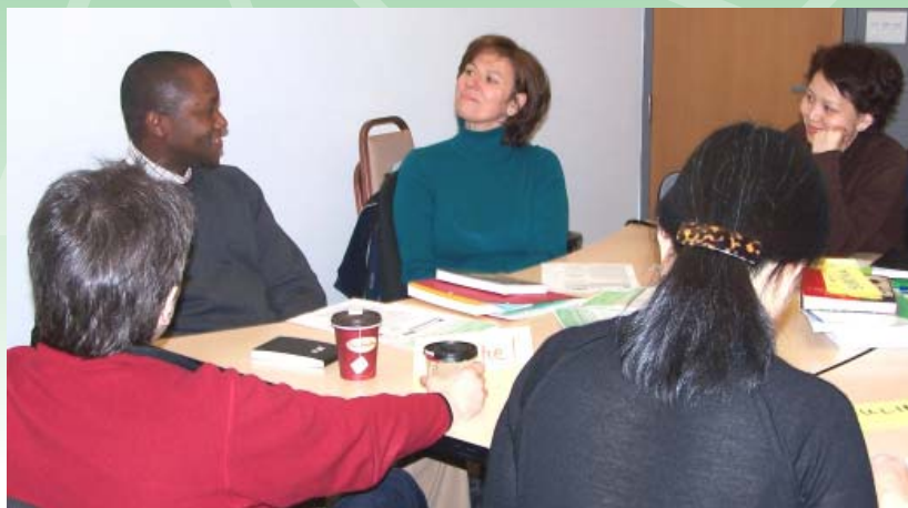
Forming groups quickly for small group work.

Here are nine effective strategies that can be used to create informal groups. Some of these activities take minimal time while others can be an activity in themselves. Some work well with large classes, while other are better suited for small classes.