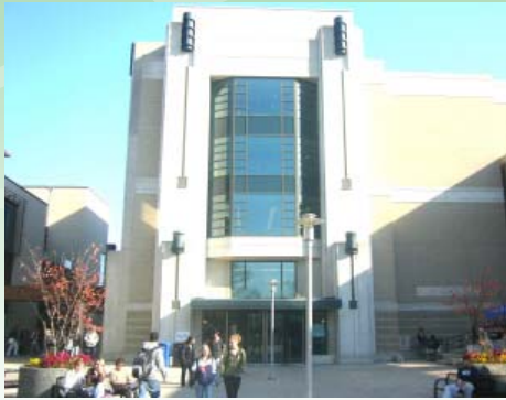
Most learning occurs outside of class.

when students have time to reflect, integrate information from different sources, and debate issues and insights with colleagues.