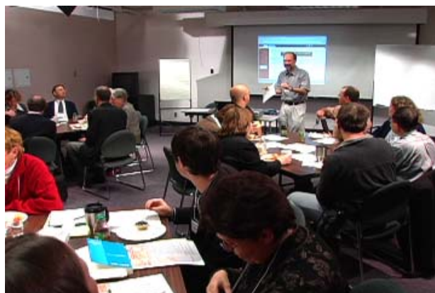
Faculty meet to redesign courses over lunch.

For more information, contact BJ Eib at eib@ucalgary.ca