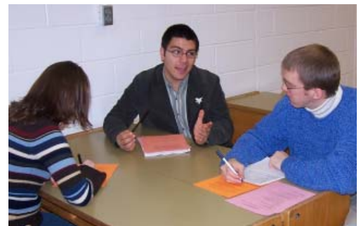
Engagement through small group discussions.

Many of the strategies for introducing active learning are well known. They include encouraging accurate student note-taking (e.g. by use of incomplete handouts 2 ), in-class demonstrations (perhaps linked to a set of interpretive questions to answer on the spot), quizzes and short opinion surveys, and brief small group discussions on questions posed by the lecturer. These techniques certainly work, and some of the lecturers who have used them successfully are among our most admired 3M National Teaching Fellows.