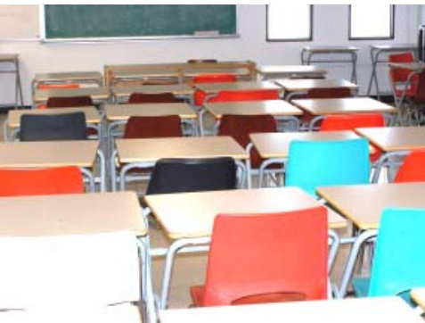
Classroom settings affect learning.

Recently, a journalist asked if I had any views on faculty claims that today's university students seem distracted (to use a polite term) in class - talking, sending text messages, even answering their cell phones.